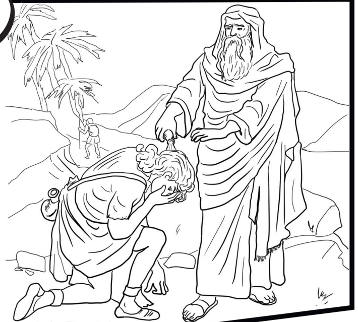
Samuel anoints David

“The Lord was with Samuel as he grew up. He did not let any of Samuel’s messages fail to come true. 1 Samuel 3:19 (ICB)