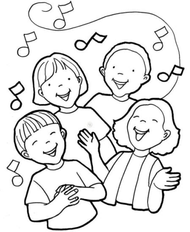
Jesus loves me, this I know,